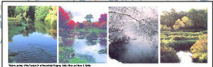
Photographs of the Taunton River and its Tributaries, taken during the study.

This map was prepared by DEP in collaboration with the Taunton River Study. It is a preliminary map and should not be used for legal purposes. The map is intended for informational purposes only. The map is not a warranty of any kind. The map is not a guarantee of any kind. The map is not a representation of any kind. The map is not a statement of any kind. The map is not a declaration of any kind. The map is not a promise of any kind. The map is not a contract of any kind. The map is not a deed of any kind. The map is not a will of any kind. The map is not a power of attorney of any kind. The map is not a trust of any kind. The map is not a lease of any kind. The map is not a license of any kind. The map is not a franchise of any kind. The map is not a trademark of any kind. The map is not a service mark of any kind. The map is not a registered trademark of any kind. The map is not a registered service mark of any kind. The map is not a copyright of any kind. The map is not a registered copyright of any kind. The map is not a patent of any kind. The map is not a registered patent of any kind. The map is not a trademark of any kind. The map is not a service mark of any kind. The map is not a registered trademark of any kind. The map is not a registered service mark of any kind. The map is not a copyright of any kind. The map is not a registered copyright of any kind. The map is not a patent of any kind. The map is not a registered patent of any kind.